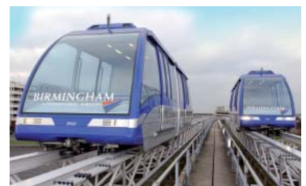
Start of operation in 2003