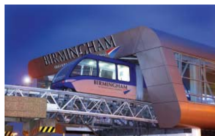
Station at the Birmingham International Airport