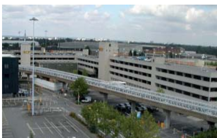
Elevated truss guideway utilizing the existing guideway structure